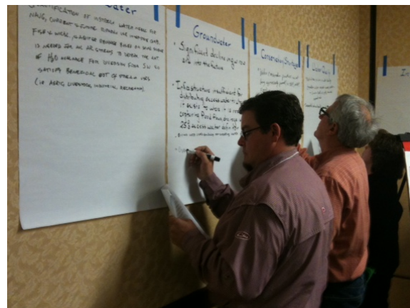
Issues identified by the Eastern Water Resource Planning Region Group were recorded by participants at the meeting in Jonesboro.

Agency Planning Team is an interagency team led by ANRC and supported by contractors provided guidance, review, and progress input to the ANRC Program Manager. The Agency Planning Team developed and implemented the stakeholder involvement and public information activities for the AWP Update.